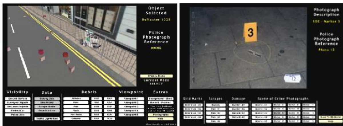
Figure 2: Image from a virtual simulation, showing vehicle debris at the crime scene